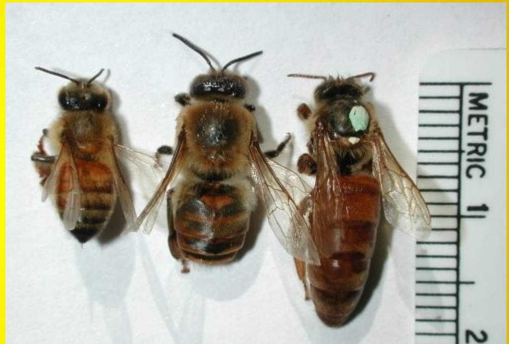
Worker, Drone, Queen (marked with dot)