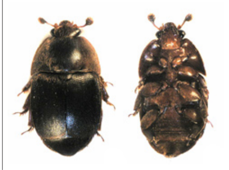
Small Hive Beetles