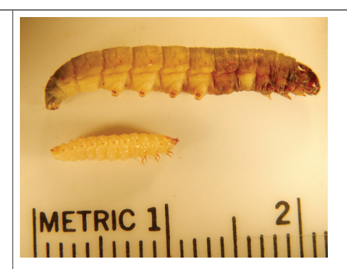
Small Hive Beetles Larvae