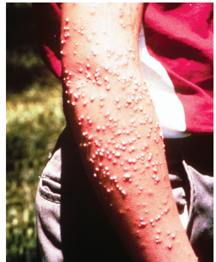
Figure 11. Pseudopustules of Arm from Fire Ant Stings