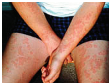
Figure 13. Urticaria or Hives

Fortunately, cardiorespiratory system responses (severe ANAPHYLAXIS) occur in less than 1 % of people incurring a bee sting. Anaphylaxis may be preceded by generalized itching, hives, and edema, and the specific cardiovascular and respiratory system reactions can progress fairly rapidly (over 1 to 30 minutes). They include wheezing, stridor (airway compromise and inability to breathe), shock (very low blood pressure causing collapse), loss of consciousness, and death. Beekeepers, family members (or anyone) who has had a moderate or severe systemic allergy to