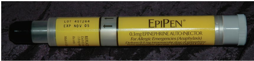
Figure 15. EpiPen Buddy Marterre, MD

mended for urticaria / hives alone in a child (under 16).